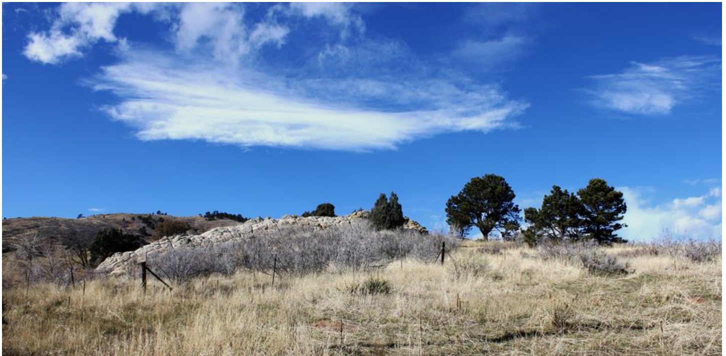
Magic Mountain site; Colorado Encyclopedia, https://coloradoencyclopedia.org/article/magic-mountain-archaeological-site