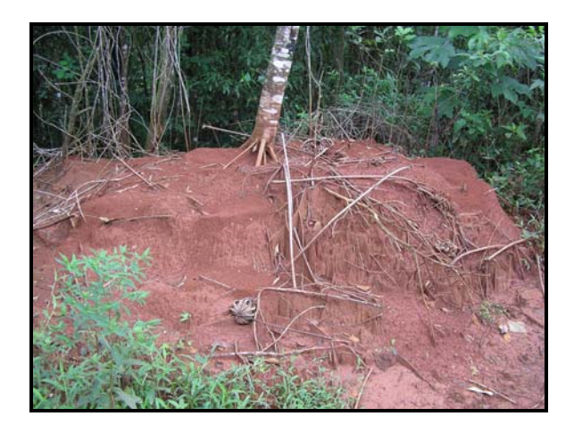
Leafcutter ant mound. Some of these critters form underground communities the size of a football field!

The Leafcutter ants form huge colonies, and can be found throughout Costa Rica. They march single file through the rainforests on trails 1 foot wide, carrying leaf sections at least twice as large as the ants themselves. The life and importance of these interesting creatures will also be discussed briefly.