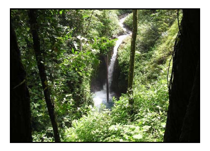
One of many waterfalls at Finca La Anita.

Caribbean plates. Consisting of heavier basaltic rock, the Cocos plate is being subducted eastward underneath the Caribbean plate. The process of subduction is widespread around the Pacific basin, where linear volcanic chains of andesitic rock are produced. The geology of northern Costa Rica is underlain by Cretaceous, Tertiary, and Quaternary rocks. Rocks of Cretaceous age include mostly shales, graywacke, conglomerate, limestone, and chert. The Santa Elena Peninsula, however, is underlain by ultramafic rock. The coastal area north of Santa Elena Peninsula is composed of sedimentary and volcanic rocks. The interior lowland is underlain by lacustrine sediments, tuffs, and dacitic lavas. The backbone of Costa Rica,