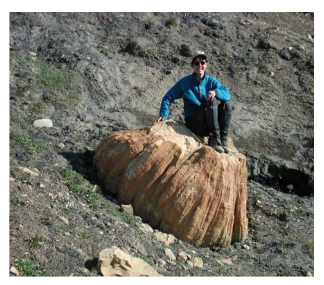
Tree in the Arctic