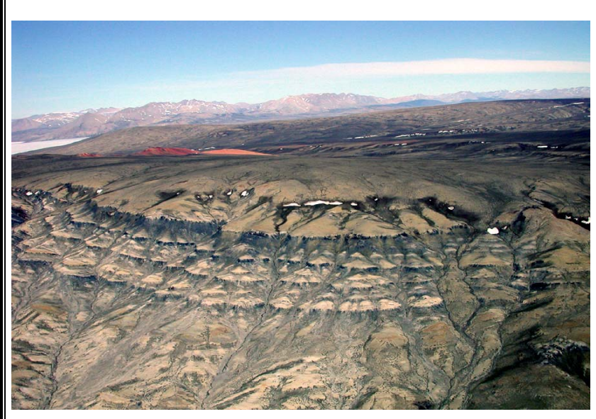
Eureka Sound Group (Eocene) Ellesmere Island

The objective of the Society is to promote the knowledge and understanding of Earth science, and its application to human needs