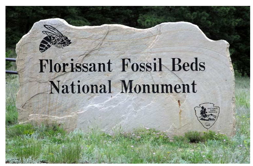
Princeton scientific expedition of 1877: the Florissant, Colorado segment

The objective of the Society is to promote The knowledge and understanding of Earth science, And its application to human needs