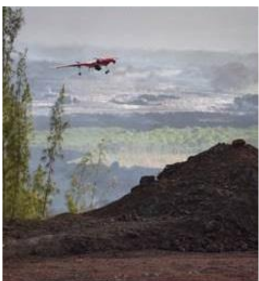
Jeff Sloan works in the USGS UAS (Unmanned Aircraft Systems; i.e., drones) program and will show how they were used at Kilauea. Drone(s) will be on display at the meeting.