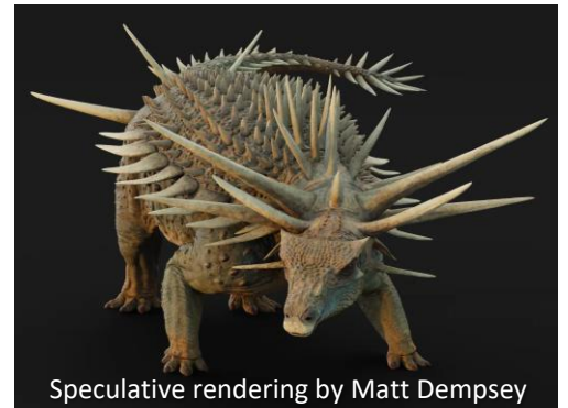
Speculative rendering by Matt Dempsey

The ankylosaur Spicomellus afer is truly one of the most bizarre dinosaurs discovered to date. Covered head to tail with elaborate osteoderms, including cervical spikes nearly a meter in length, Spicomellus looks more Hollywood kaiju than factual dinosaur. However, it's not just the appearance of Spicomellus that makes it unique. The construct of its bizarre armament is unlike any other vertebrate—extinct or extant. Being from the Middle Jurassic, Spicomellus is also the oldest ankylosaur thus far known; and with this bizarre body armor, is rewriting the functional and evolutionary role of armor in this dinosaurian clade. Spicomellus , along with other Gondwanan clades found within the El Mers Group, are helping to further push back, and elucidate, the origins of several dinosaurian lineages.